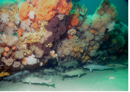
A school of Atlantic cod shelter beneath a colorful outcrop of marine invertebrates.

For more information, or to be added to the distribution list for management plan review updates and announcements, please email <u>sbnmsmanagementplan@noaa.gov</u>